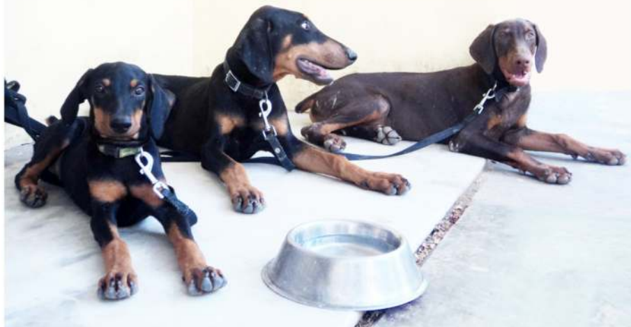
We too have joined the GANG!