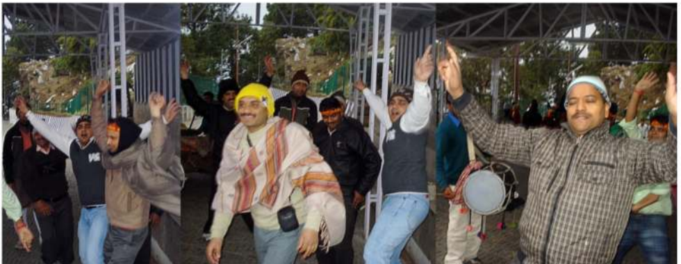
Devotion - In High Spirits

They all left from office. After taking an overnight train journey from Delhi to Jammu, there was a 2 hr bus journey to Katra. This is the base camp where all the pilgrims assemble to start the 12 km (7.5 miles) hike up the hill to The Bhavan. This is the main place of worship and has the holy cave which has the manifestation of Mother Goddess – Mata Maha Kali, Mata Maha Lakshmi and Mata Maha Saraswati. Shri Mata Vaishno Devi Ji is considered to be an incarnation of the three Supreme Energies.