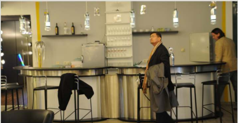
Teetotaller Balam - Although in a bar, but work still on the mind. At a lighting factory.

Now these products will be available in our showroom "Kapoor Lampshade", and Indian customers could have a wider selection on variety, design, exclusivity in affordable price ranges.