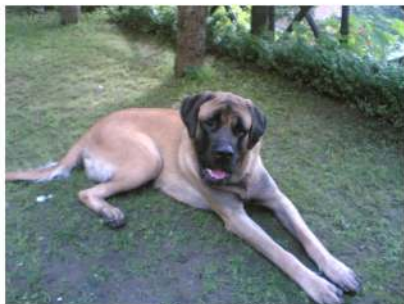
Our Hero - CHIP..!

Over the last year or so, we have been very unfortunate with our dogs, we lost 3 beautiful dogs of ours, Shera, Bubbles & Chip. Chip was the "Hero" of them all. Anyone who went to Pine-Springs in Nainital, fell in love with Chip. He was a real beauty. We all still miss Chip!