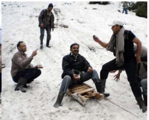
Enjoying the horse riding and skiing at Patnitop